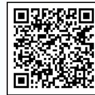
Scan this QR code to make downloading easy!